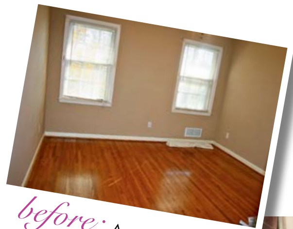
before: An empty room.

With a sewing machine and some imagination, we turn an empty space into an avant-garde bedroom — for only $200.