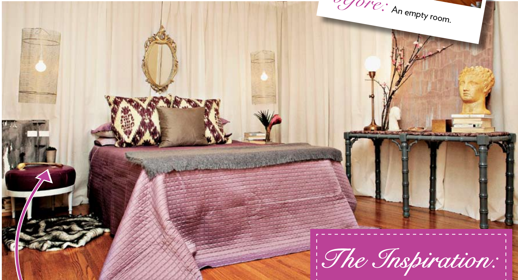
after: A stylish bedroom that doesn't take itself too seriously.